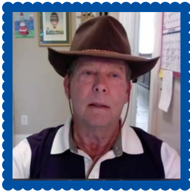
BILLY THE KID