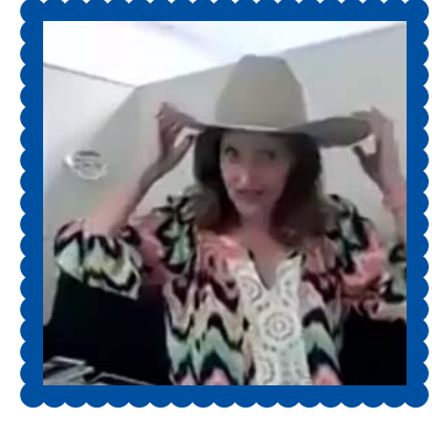
COW GIRL KIM