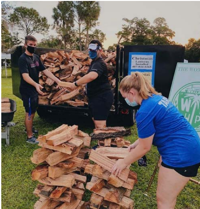
ROTARACTORS STACKING WOOD

“When do we again meet live and in person?” A committee has been appointed to develop a detailed plan to recommend to the board within the next ten days. I share in the eagerness to return to business as usual but the stakes are too high to approach the challenge with anything less than laser focus on safety. Stand by for updates as decisions are made. In all likelihood the Zoom option will remain open to those uncomfortable in abandoning the assurance of self-quarantine.